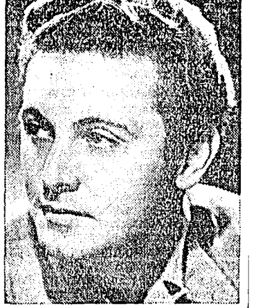
Allan Jones, Hollywood favorite, will make a guest appearance on the Mutual quiz show, Double or Nothing, to be aired over W-G-N at 9:30 tonight.