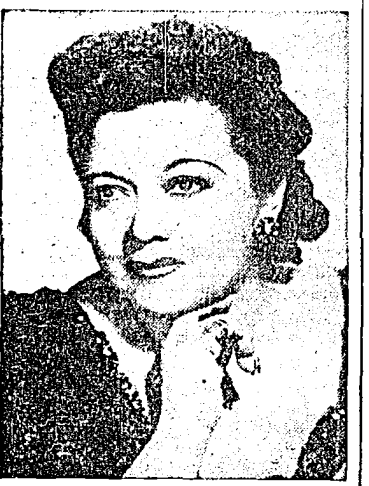
Mildred Bailey will be the featured songstress on the "Time Out for Laughs" show, starring Lou Holtz, starting over WBBM-CBS at 6:15 tonight.